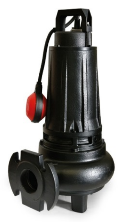
Attention: pictures for illustrative purposes

Installation: Vertical Floating on board machine: vertical not present